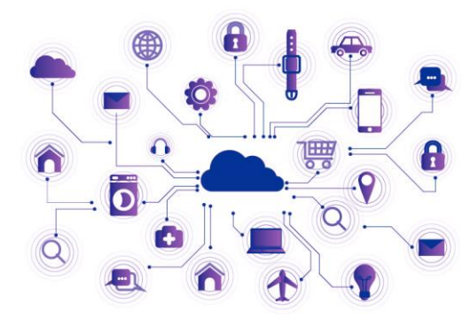
Figure. 1. IoT can be viewed with devices connections as a Network.

can run. This is evident from the ambiguity in the expression of "Things" which makes it difficult to outline the ever-growing limits of the IoT [3].