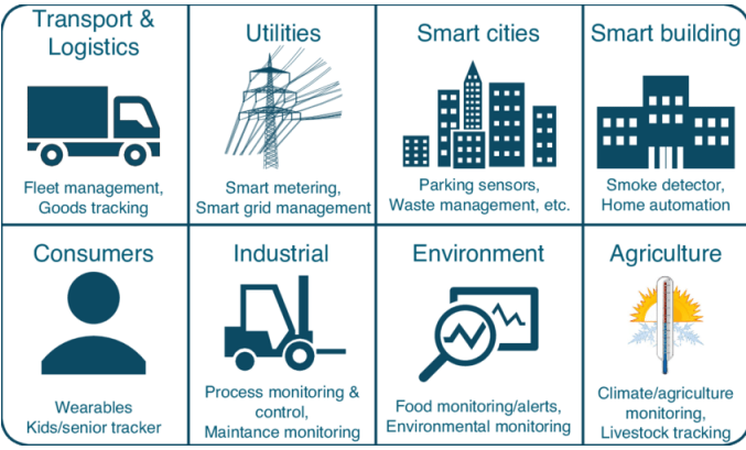
Figure 4. The Massive IoT applications

Massive IoT means the services typically expanding relaying on a huge number of devices, sensors, and actuators. Sensors are low cost and very low energy consuming. But in fact, generated data by each sensor will be small, and very low latency. While actuators are also low cost, they will have varying energy footprints ranging from very low to moderate energy consumption. Here we will show Vertical markets for Massive IoT tech, figure 4 shows the massive IoT applications. [12]